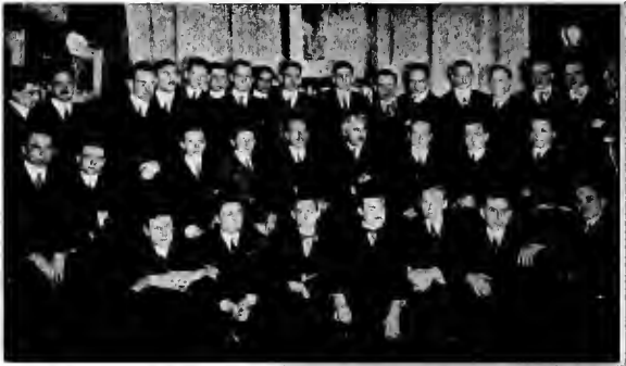
A BIBLE CLASS OF MEDICAL STUDENTS

The medical course makes the most severe demands upon its students. There is no time free for the normal Association activities. Nevertheless, mindful of the need for conserving the high ideals which prompted the choice of his profession, and of the unique opportunity of the Christian physician, the Association has adapted its program to meet the taxing schedule of these men and serves them, especially emphasizing the Christian and ethical side of the physician's work.